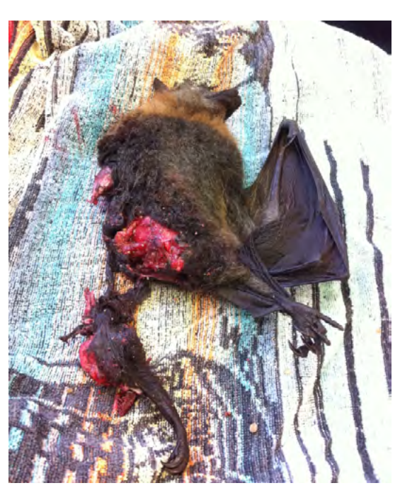
Wildlife with injuries from dog or cat attacks

Pets are valued and important members of our families but if we do not act responsibly, they can have a massive negative impact on our native wildlife. Cats, especially, have bacteria that can be fatal to some of our smaller species. Unfortunately these attacks happen and when they do, the most important thing is to get help for the animal as soon as possible, so please call our emergency number 03 8400 7300.