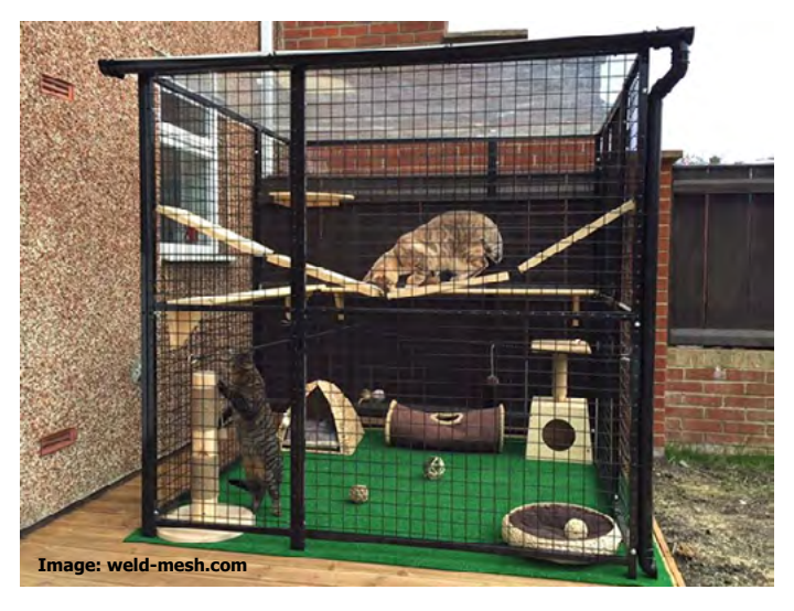
A cat run keeps your cats and wildlife safe from each other

We hope that by increasing your understanding and awareness of our beautiful wildlife, you feel empowered to deal with wildlife situations confidently in an informed, safe and appropriate manner. For support at any time, please call our emergency response service for advice on 03 8400 7300 or report the details on our website: www.wildlifevictoria.org.au. ABN: 27 753 478 012