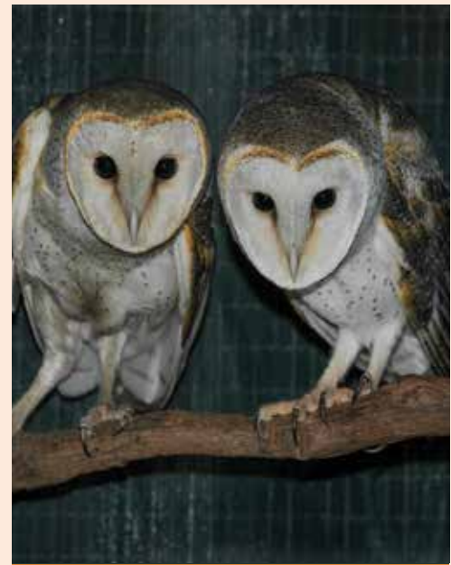
Barn Owls in rehabilitation

"I already have an intensive care unit at the shelter, but now with this humidicrib, a much larger bird can be hospitalised in