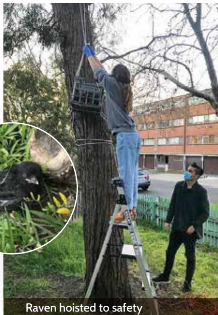
Raven hoisted to safety

With a little bit of ingenuity, a pulley system was rigged up and the bird was returned home safe and sound!