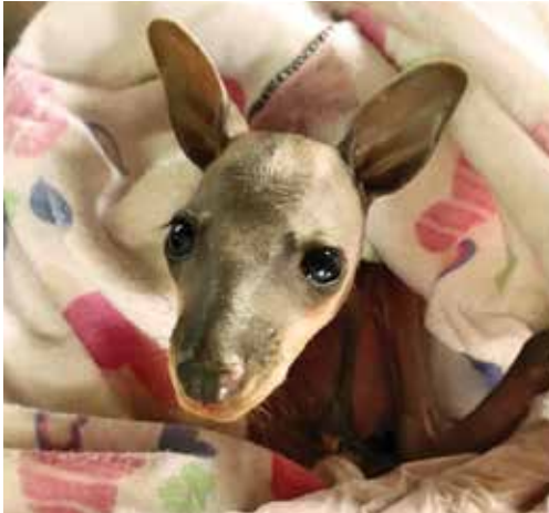
Bella was rescued from mum's pouch

Spring is the season for wildlife orphans, and a peak period for calls to our Emergency Response Service. We are constantly reminding people to check marsupial pouches for orphaned babies!